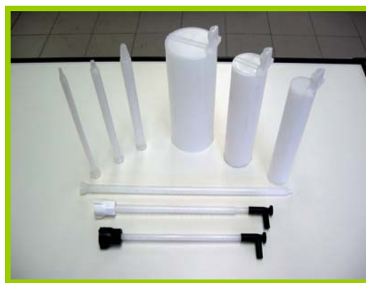
Assorted mix tubes and material cartridges.