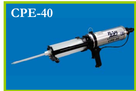
4" pneumatic cylinder

Contact your BJB representative to assist you in choosing the system and materials that best suit your needs.