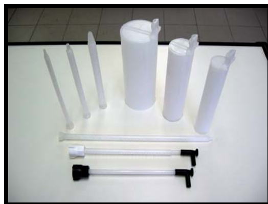
Assorted Mix Tubes and Material Cartridges