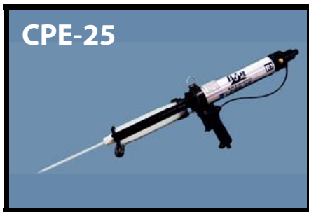
2½" Pneumatic Cylinder