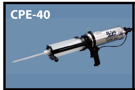
4" Pneumatic Cylinder

Contact your BJB representative to assist you in choosing the system and materials that best suit your needs.